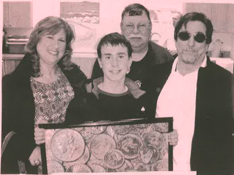
The Guinta family was the winner of the gold coin photo at the show.