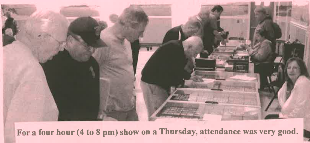
For a four hour (4 to 8 pm) show on a Thursday, attendance was very good.