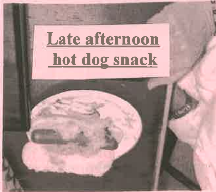
Late afternoon hot dog snack