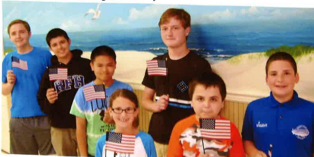
The seven YN's at our June 4 th meeting were presented flags for a group photo for Flag Day