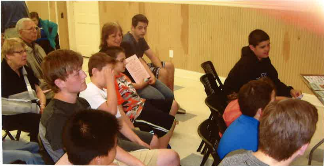
Eight YN's attended the meeting of May 21 naturally with a family member that had to get them there and we sincerely keep thanking them for their taking the time to be with us.